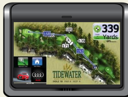
GPS & Yardage